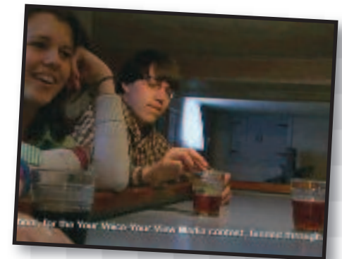
2009 award winning YVYV ad was submitted by Lincoln High School and focused on ending myths about sexual assault.

For All Victims — Close to 50 dedicated Helpline Advocates provided support, information, referrals and safety planning to victims at hospitals and police departments throughout Rhode Island in 2009. Helpline Advocates receive over thirty hours of training giving them the skills, knowledge, and confidence to work with victims of all ages. Helpline