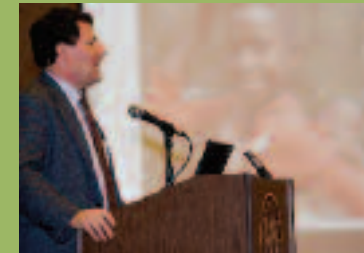
Keynote speaker Nicholas Kristof speaks at the Day One annual luncheon.